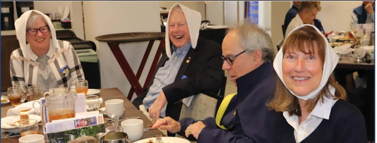
More Babushka-infused Judges